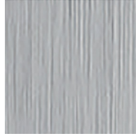
Natural anodized - ANA